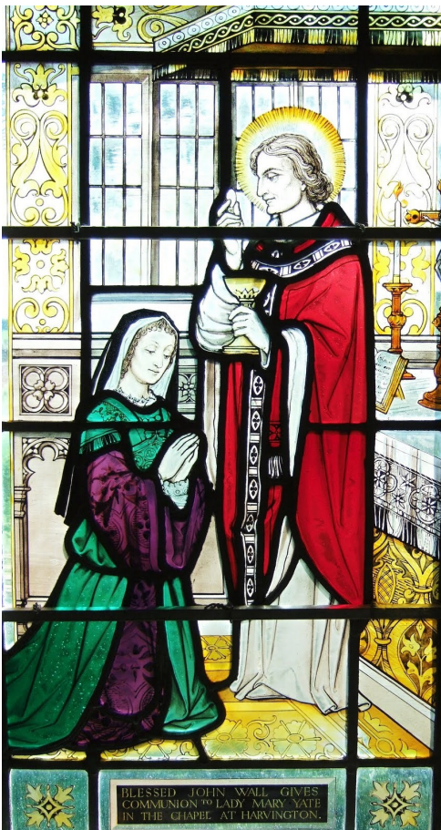
Image of a stained glass window in Harvington Hall

It was at Rushock Court, not very far from Harvington, that Saint John Wall was captured in 1679 and taken before a Justice of the Peace where he made a public profession of his religion and also swore loyalty to the King. All to no avail as he was taken to Worcester where he faced trial. On the 22nd August he was executed by being hung, drawn, and quartered. He died in his 60th year and the 29th year of his Priesthood. He was canonized on the 15th December 1970 by Pope Paul VI and his Feast Day is usually celebrated on the 22nd August. The large crucifix in our churchyard here at Harvington is dedicated to his memory.